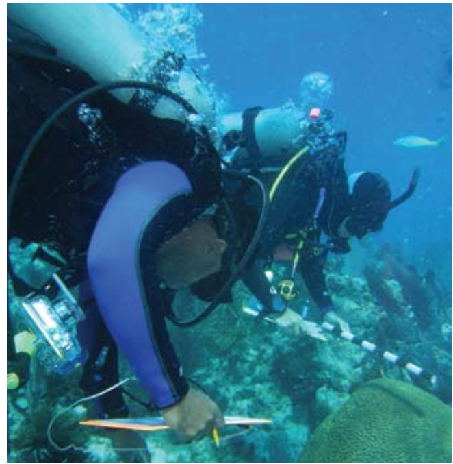
Left Image: Coral bleaching is one impact of climate change on Florida's reefs. While typically associated with warmer than normal water temperatures, it can also happen when temperatures drop below their normal range, as happened in early 2010. Right Image: In 2008, NOAA conducted climate change and coral bleaching training in the Florida Keys; a tool to help local reef managers address the effects of climate change.