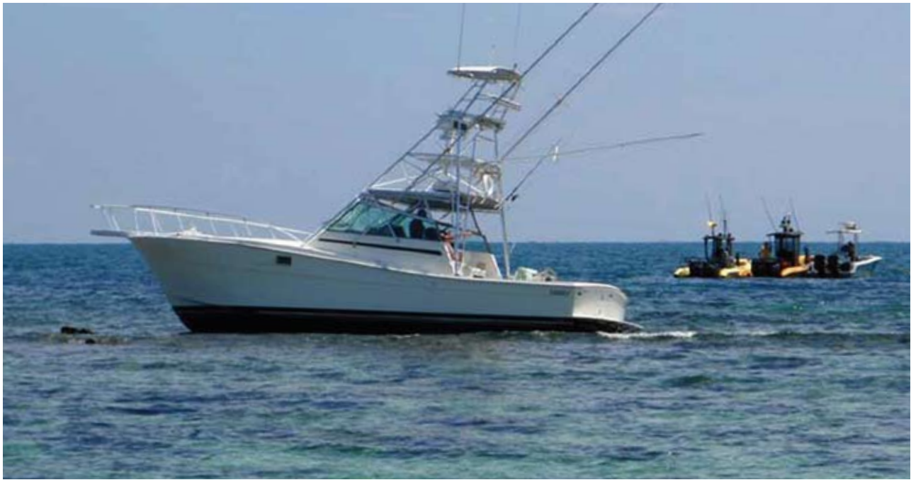
Recreational vessel grounded at Grecian Rocks off of Key Largo.