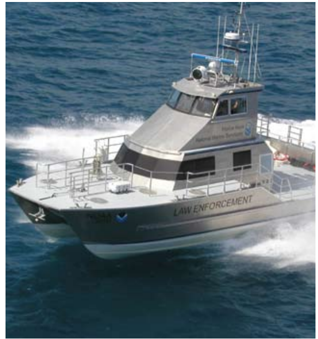
Left Image: One way to reduce impacts to benthic habitats is to implement marine zoning, including installation of mooring buoys, such as this buoy in Broward County. Right Image: Enhancing law enforcement capacity and efficacy are also goals for Florida; increased marine patrols may be part of a solution developed for the region.