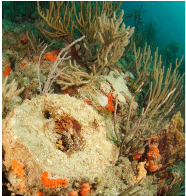
Left Image: Aerial image of blackwater from the St. Lucie River flowing onto coral reefs in St. Lucie Inlet Preserve State Park. Right Image: Sediment covers coral at a popular dive site in Palm Beach.