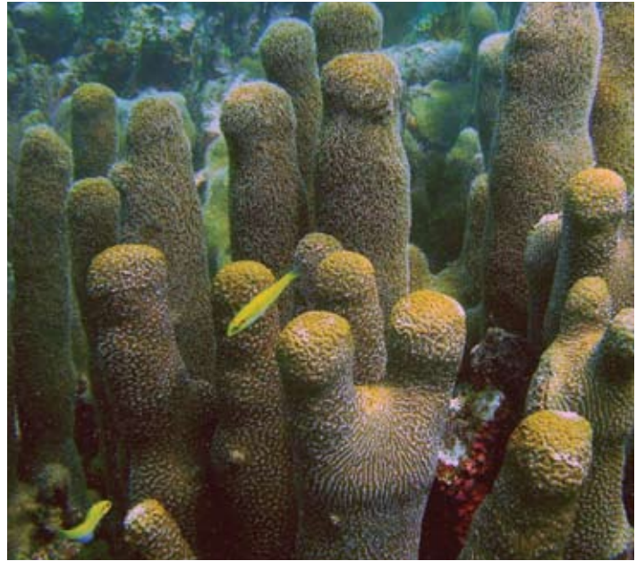
Pillar corals in the Florida Keys National Marine Sanctuary.

Fishing is another broad category that captures the priorities and goals related to the impacts of fishing—both recreationally and commercially—on reef systems, including overexploitation, bycatch and physical impacts to coral reef habitat from gear. This integrates with Restoring and Maintaining the Functional Integrity of Natural Habitats listed above.