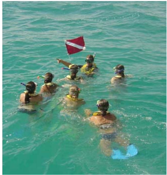
Educating the public and elected officials about the importance of maintaining coral reef habitats and coastal water quality is a priority in Florida. Outreach is also a means of educating the public about fishing, diving, and boating regulations as well as influencing behavior change in relation to boating and diving practices that impact reefs.