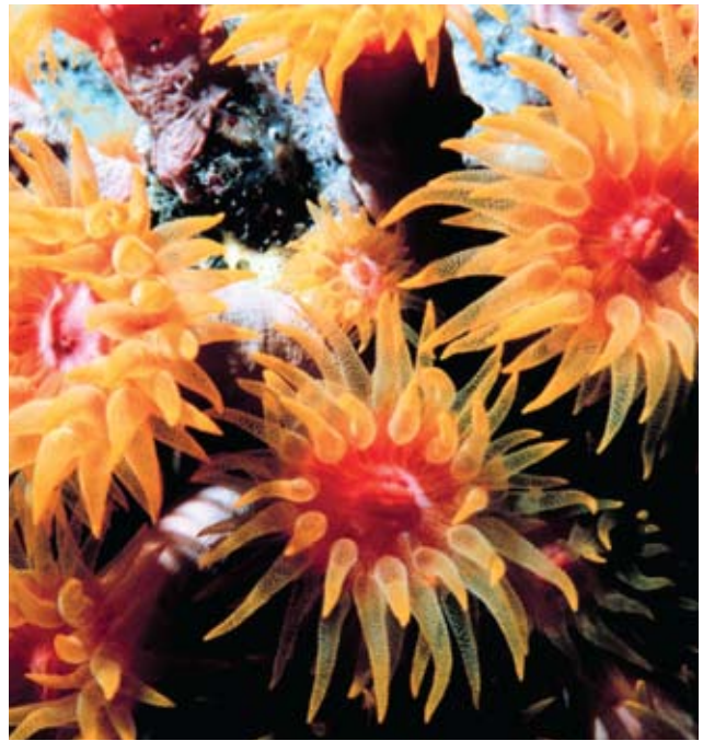
Indo-Pacific red lionfish and orange cup coral are invasive species in Florida's waters.