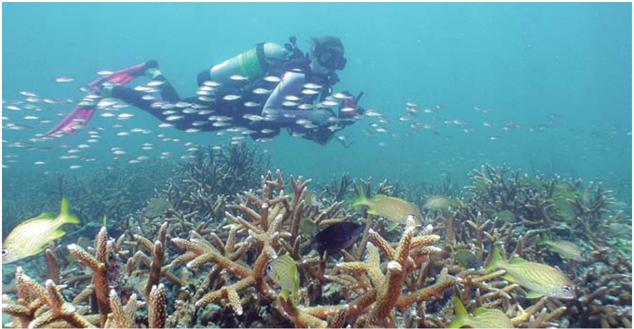
Diver gliding over staghorn coral ( Acropora cervicornis) thicket off of Broward County, Florida.

Task Force, Great Barrier Reef Marine Park Authority, Fisheries Management Councils, U.S. Coral Reef Task Force).