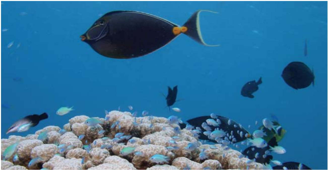
Marine preserves like Piti Bomb Holes Marine Preserve are proven fishery management tools that increase the size of reef fish within and surrounding their borders.