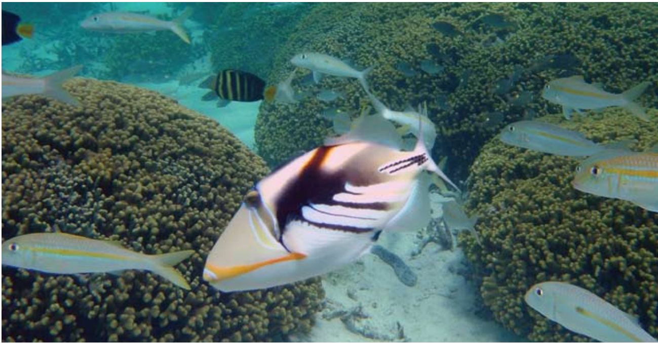
Healthy coral reefs provide important habitat for reef fish.