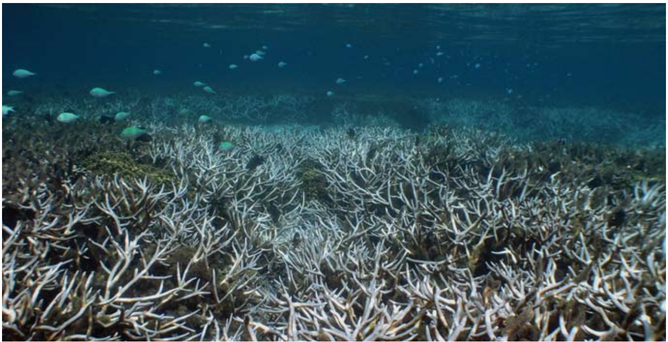
Bleached coral in the shallow waters of the Tumon Bay Marine Preserve.