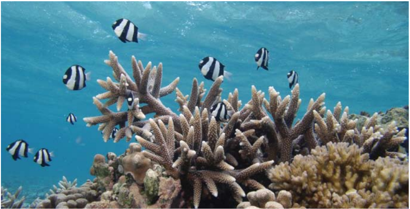
Healthy coral in the shallow waters of Guam.