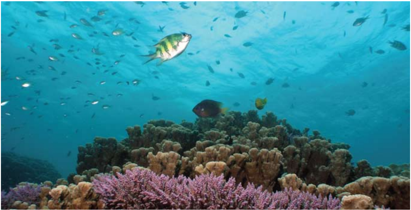
Resilient coral ecosystems are better able to recover from adverse impacts; Guam's objectives include addressing ecosystem resilience.