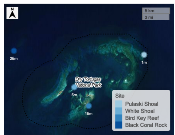
Figure 1: Study sites and depths in Dry Tortugas National Park.