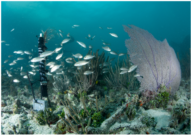
New Subsurface Temperature Recorder deployed at White Shoal in Dry Tortugas National Park.