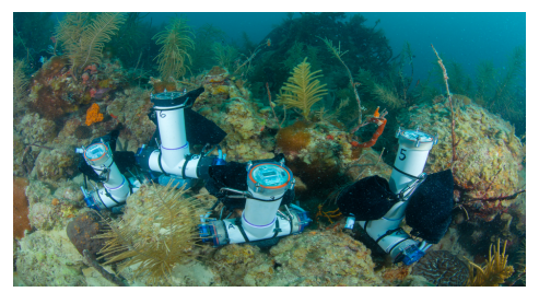
Deployed SAS for collecting water samples every three hr.